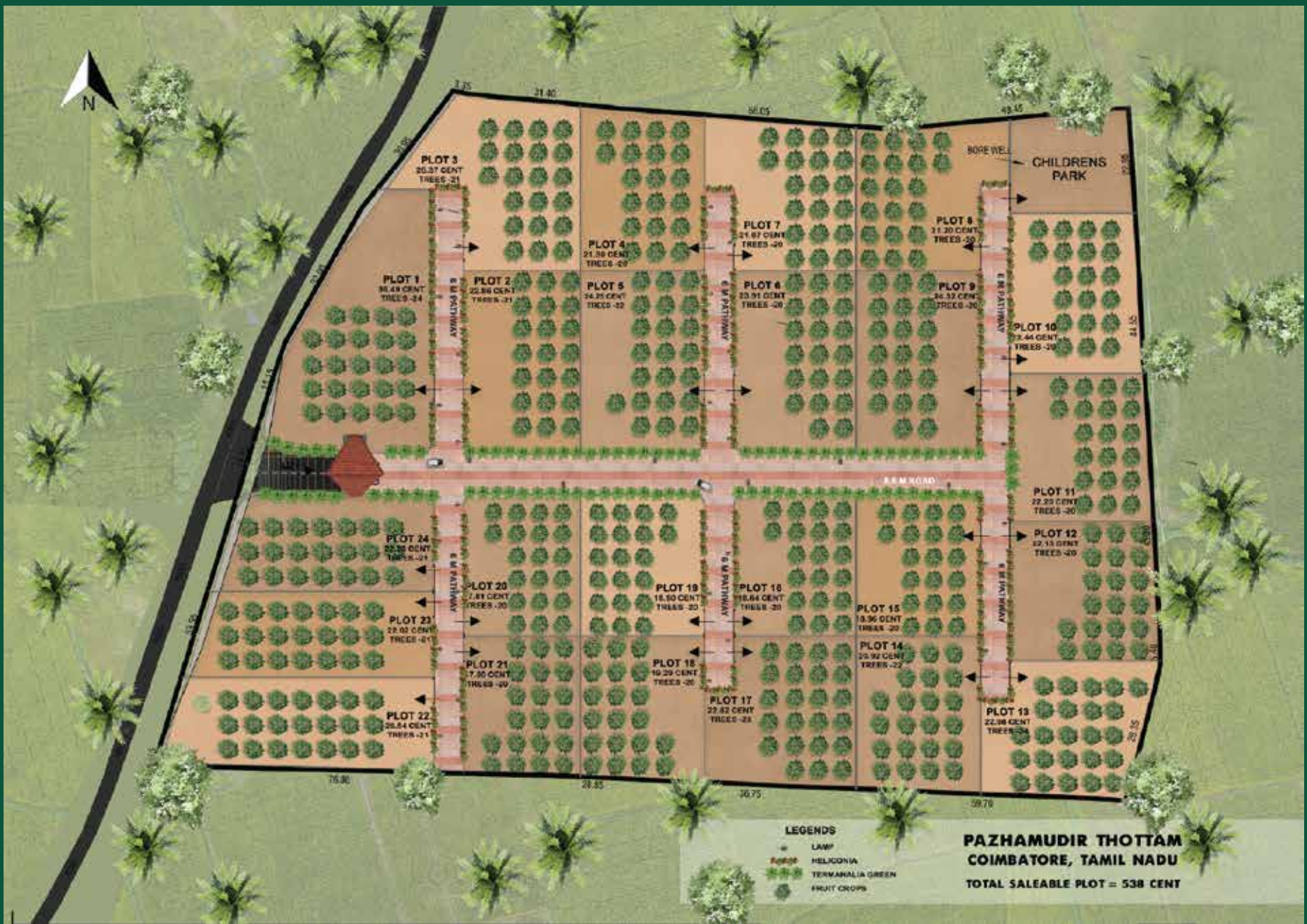
Plot sizes: 18 - 34 cents

Each plot is adorned with mango, chikoo, guava, jackfruit, lemon, moringa, coconut, and watermelon trees. Additionally, approximately 1000 - 2500 sqft of space is allocated for constructing farmhouses, catering to user preferences.